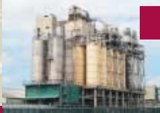
Pulp & Paper