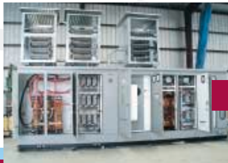
5th & 7th High-Pass Filter