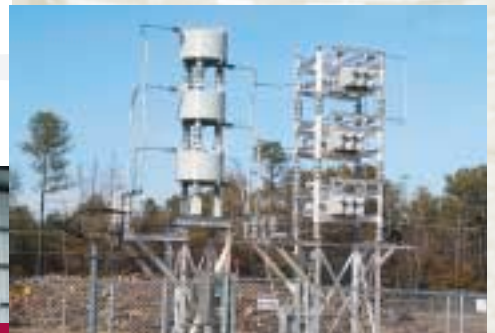
5TH Harmonic Notch Filter