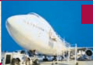
Airports & Aviation