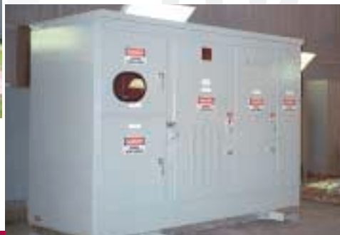
5-35 KV Metal Enclosed