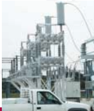
138 KV Utility