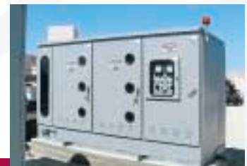
15 KV Automatic