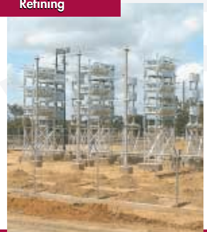
Heavy Oil Production