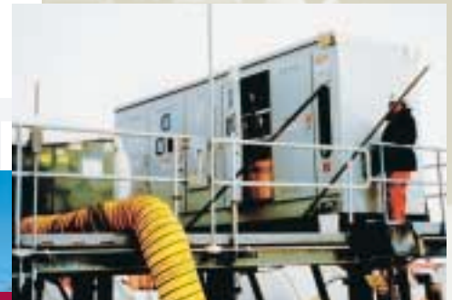
North Slope Alaska