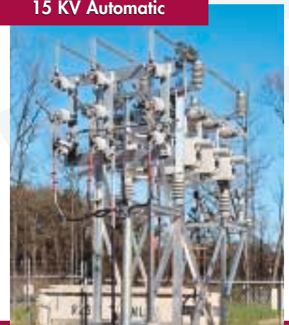
Static Substation Assemblies