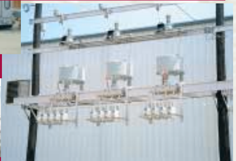
Double Pole Utility Filter