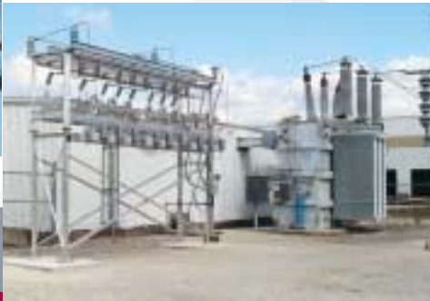
15 KV Substation Automatic