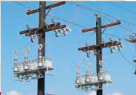
Motor Starting Electric Utility