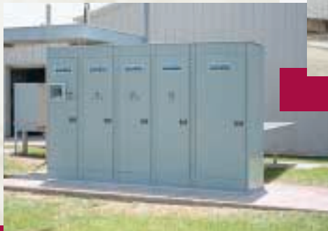
240-480 & 600VAC Automatic