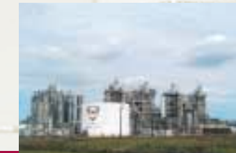
Oil & Chemical Refining

Phaseco offers innovative, creative and responsive solutions for power factor correction and harmonic filter requirements up to 230 kV. Our firm meets our clients' diverse challenges, and we base our reputation on our willingness to do whatever it takes to make sure our clients' needs are not only met but exceeded!