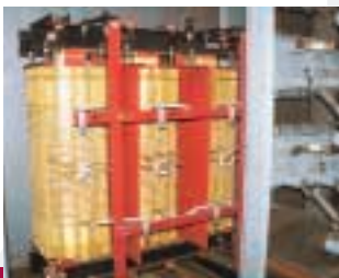
Iron Core Reactor