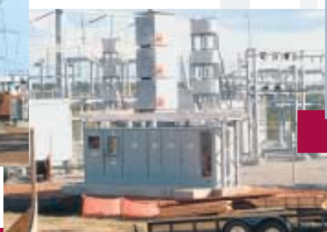
5th & 7th "H"-Type Filter