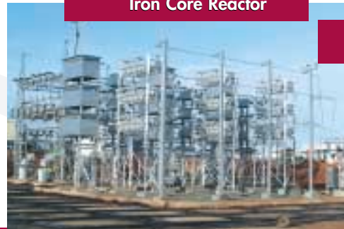
5th, 11th & 23rd Harmonic Filter